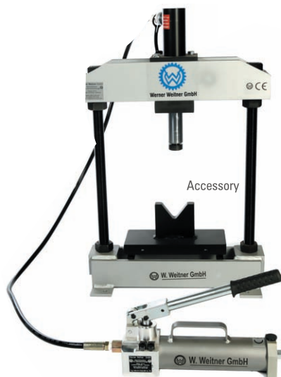
Hand pump version

Press base frame, Single acting hydraulic cylinder, Hydraulic tube, Hydraulic hand pump, Ready to assembly.