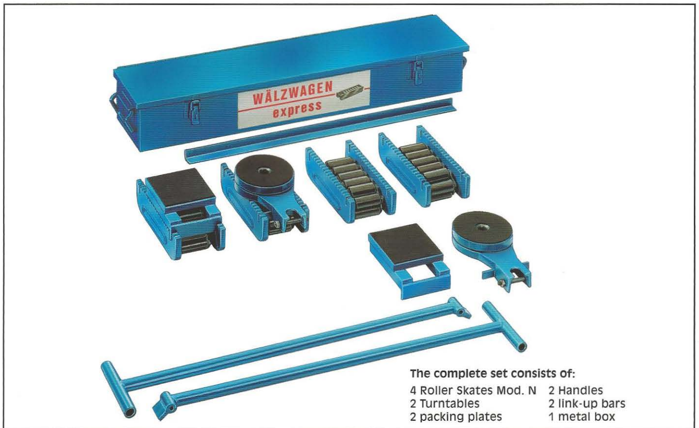
The complete set consists of: 4 Roller Skates Mod. N 2 Handles 2 Turntables 2 link-up bars 2 packing plates 1 metal box